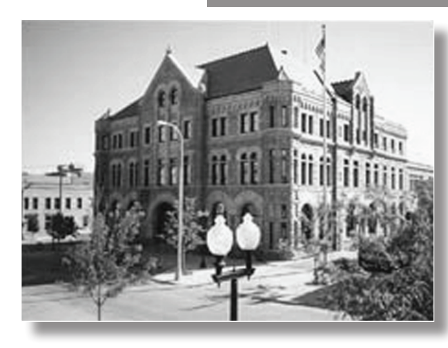
US District Courthouse, Sioux Falls, SD

From top left: Tent Rocks photo courtesy of Michael Dechter; Courthouse, Sioux Falls, South Dakota, photo courtesy of General Services Administration, http://rmrpbs.gsa.gov/internet/PBSWeb.nsf/0/a704c21a7427f8d4872569b50079ac3d?OpenDocument