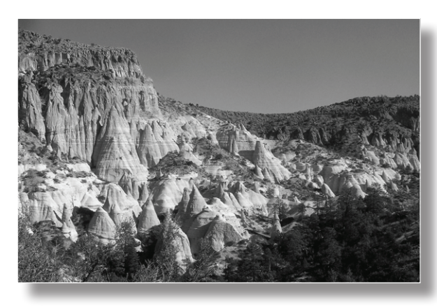
Tent Rocks, Jemez Mountains.