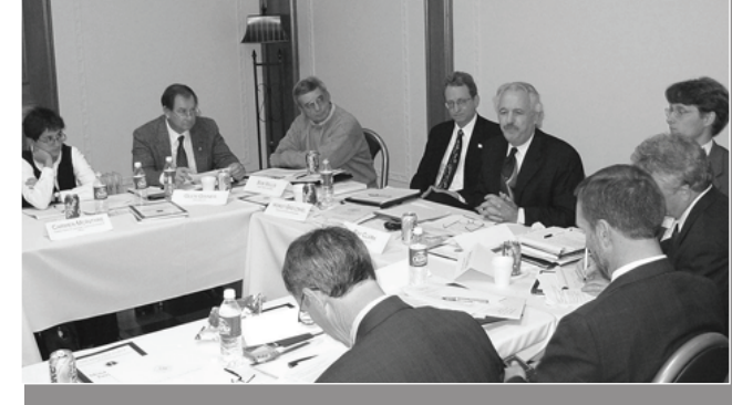
Southern Regional NEPA Roundtable discussion on the NEPA Task Force report Modernizing NEPA Implementation