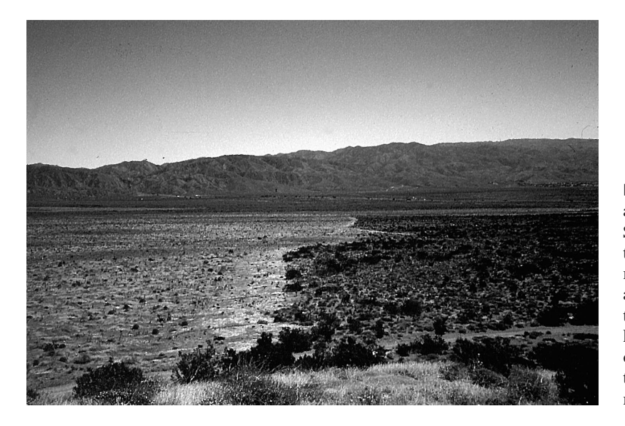
Figure 2. The effects of fire in the desert are obvious in this photo taken near Palm Springs, California, about five years after the blaze. Note the almost complete elimination of perennial shrubs in the burned area to the left. Perennial plant species in the Mojave and Colorado Deserts are longlived and very sensitive to fire, traits that collectively contribute to the long recovery times typical of many desert plant communities after fire.

sponse to SO<sub>2</sub> and NO<sub>2</sub>. Larrea tridentata is sensitive to fumigation by these pollutants under experimental conditions, displaying extensive leaf injury and reduced growth or dry weight. Encelia farinosa and Ambrosia dumosa show intermediate responses, while Atriplex canescens appears to be resistant (Thompson and others 1980). Sensitivity also varies among native annual plants, with Camisonia claviformis, C. hirtella, and Cryptantha nevadensis exhibiting leaf injury at low concentrations of SO<sub>2</sub> and O<sub>3</sub> (Thompson and others 1984b).